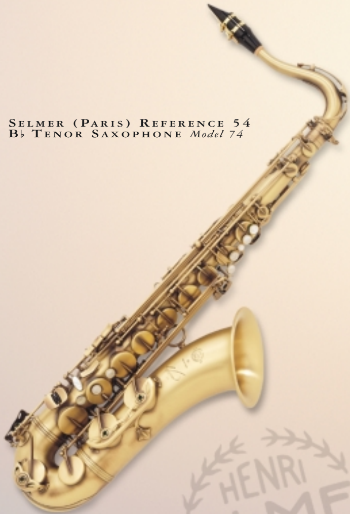
SELMER (PARIS) REFERENCE 54 B \flat TENOR SAXOPHONE Model 74