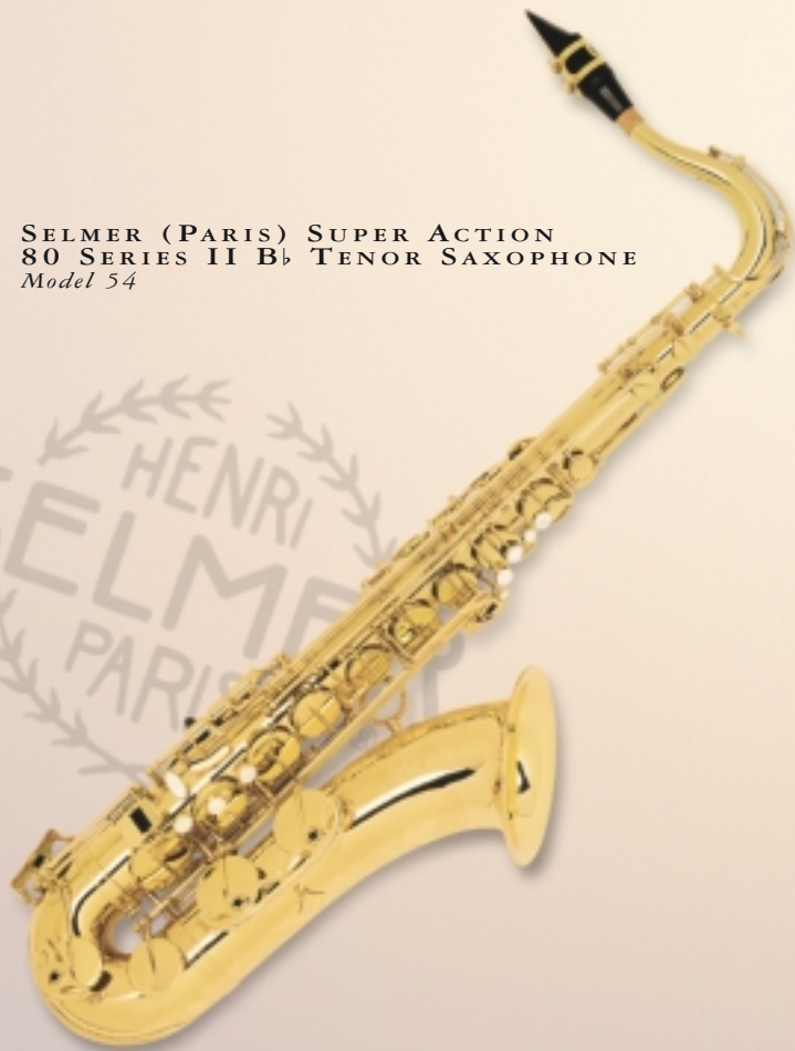
SELMER (PARIS) SUPER ACTION 80 SERIES II B \flat TENOR SAXOPHONE Model 54