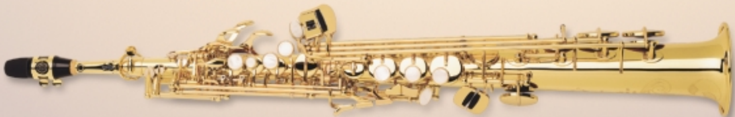
SELMER (PARIS) SUPER ACTION 80 SERIES III B♭ SOPRANO SAXOPHONE Model 53