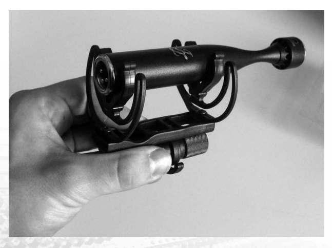
BT201 microphone on JZ microphone shock-mount JZI|7

Tip: We highly recommend to use JZI|7 shock-mount together with your BT201 microphones as JZI|7 has extremely effective damping characteristics allowing you to maximally reduce any unwanted sounds appearing in your mix together with high quality signal from your BT201 microphone.