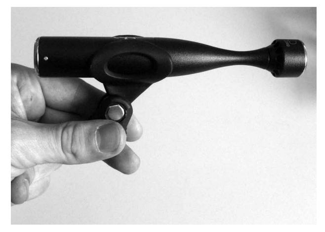
BT201 microphone on standard microphone holder JZ|HLDR

2. When you have selected the desired BT201 microphone you are ready to use the microphone holder or shock-mount to mount the microphone on the microphone stand. JZ Microphones offers optional shock-mount JZI|7 and holder JZ|HLDR for your BT201 microphones (see pictures)