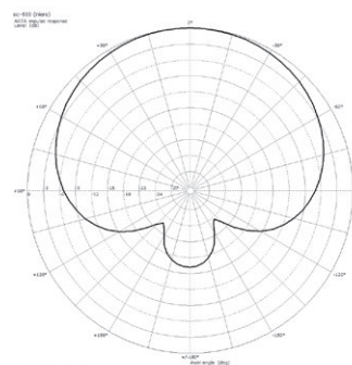
Polar pattern @ 1 kHz