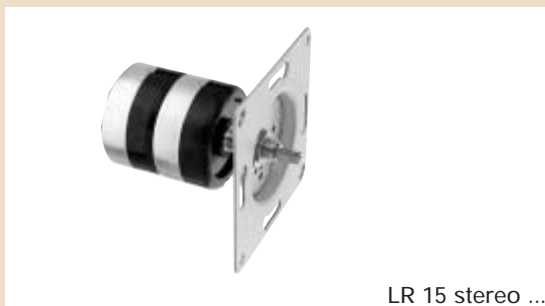
LR 15 stereo ...