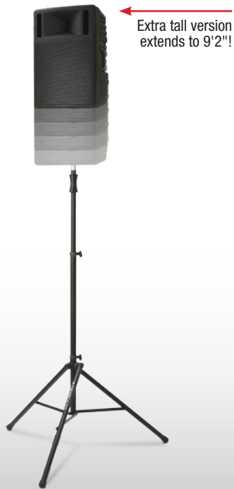
TS-110B Extra Tall Air-Powered Speaker Stand