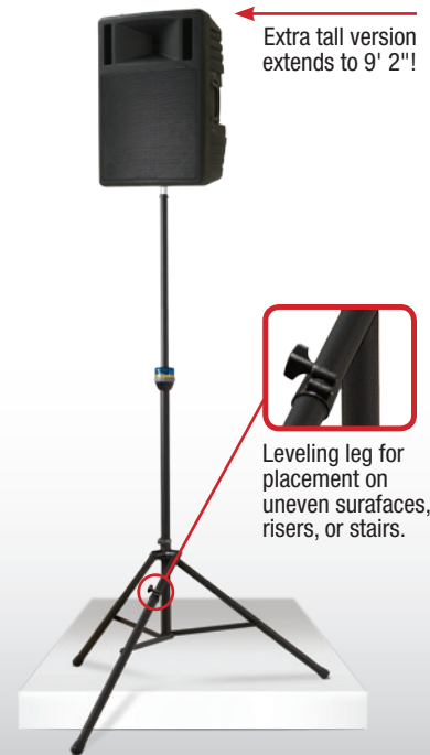
TS-99BL Extra Tall TeleLock™ Speaker Stand with Leveling Leg