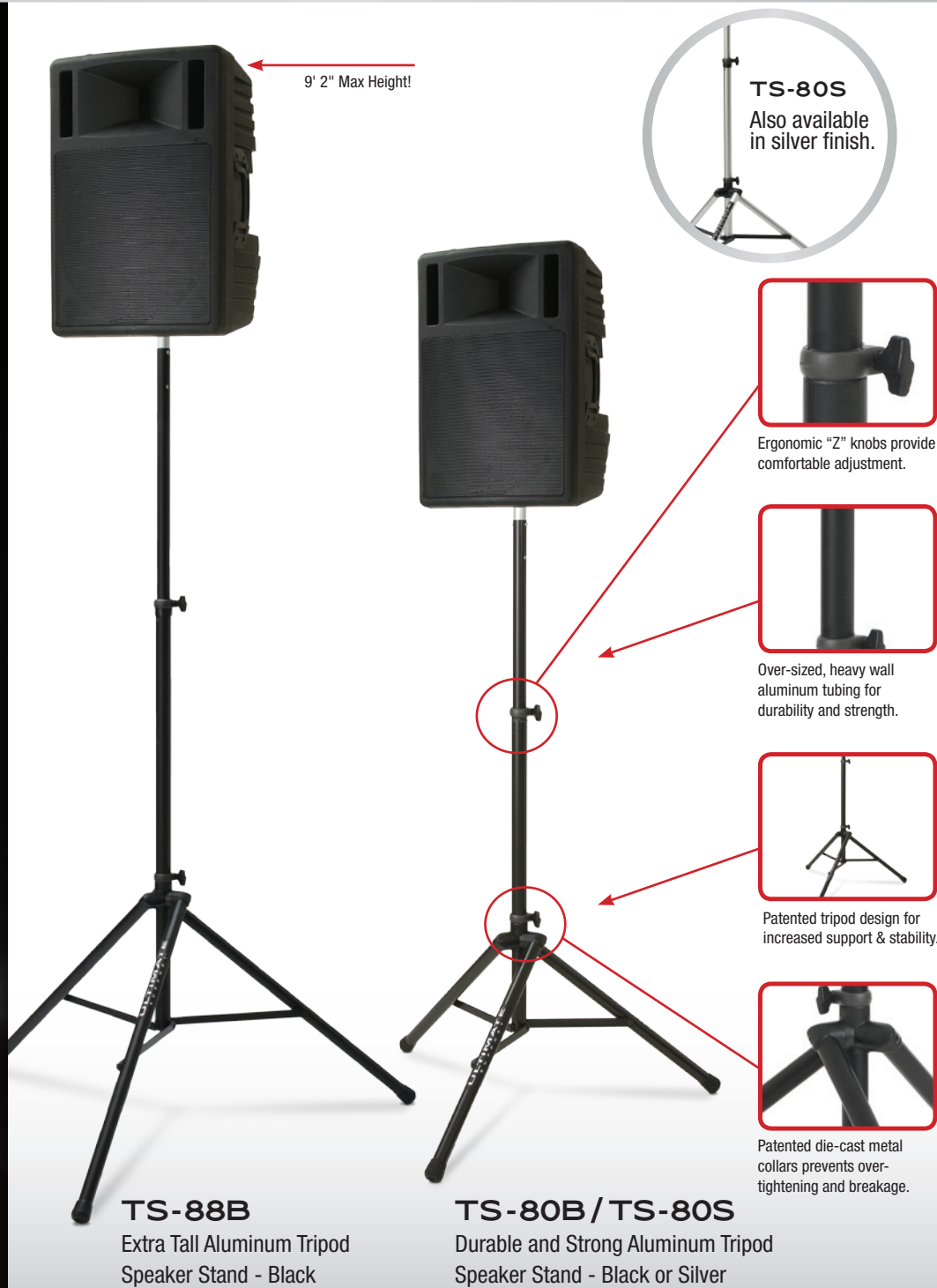
TS-88B Extra Tall Aluminum Tripod Speaker Stand - Black

The Original Series speaker stands from Ultimate Support are extraordinarily strong yet lightweight due to their over-sized heavy wall aluminum tubing. They're everything you'd expect from an Ultimate Support speaker stand – they're strong, sturdy, lightweight, and 100% field serviceable.