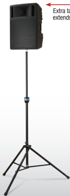
TS-99B Extra Tall TeleLock™ Speaker Stand