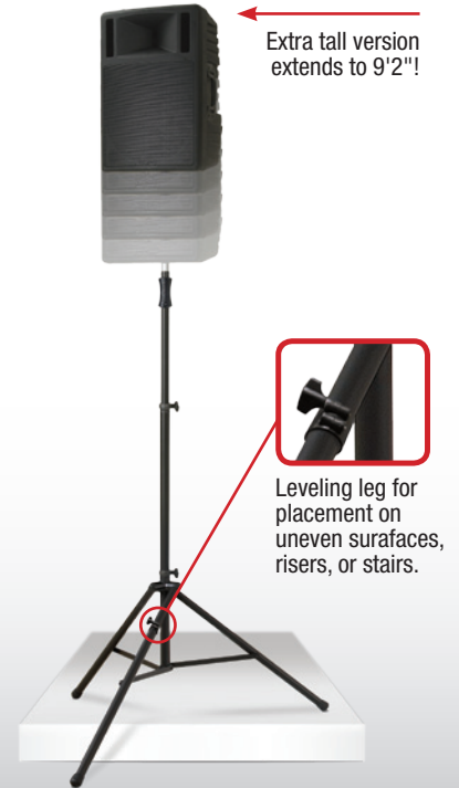
TS-110BL Extra Tall Air-power Speaker Stand with Leveling Leg