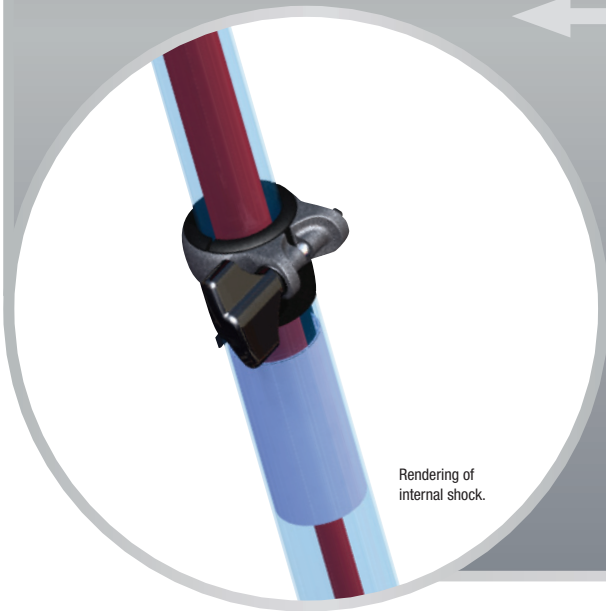
Rendering of internal shock.

Air-Powered Series speaker stands from Ultimate Support are the easiest speaker stands in the world to use thanks to the internal air-powered shock that literally raises the speaker for you. The stand's internal shock easily raises speakers weighing 50 lbs and less with no effort from the user (the Mackie SRM Series, JBL EON Series, and QSC K Series all weigh far less than 50 lbs, for instance). And, the TS-100 requires very little effort from the end user to raise speakers weighing more than 50 lbs. When you're ready to lower the speaker, we've provided a convenient and ergonomic hand grip from which you can lower the speaker. There's never been an easier, more convenient, or safer way to set up and tear down speakers.