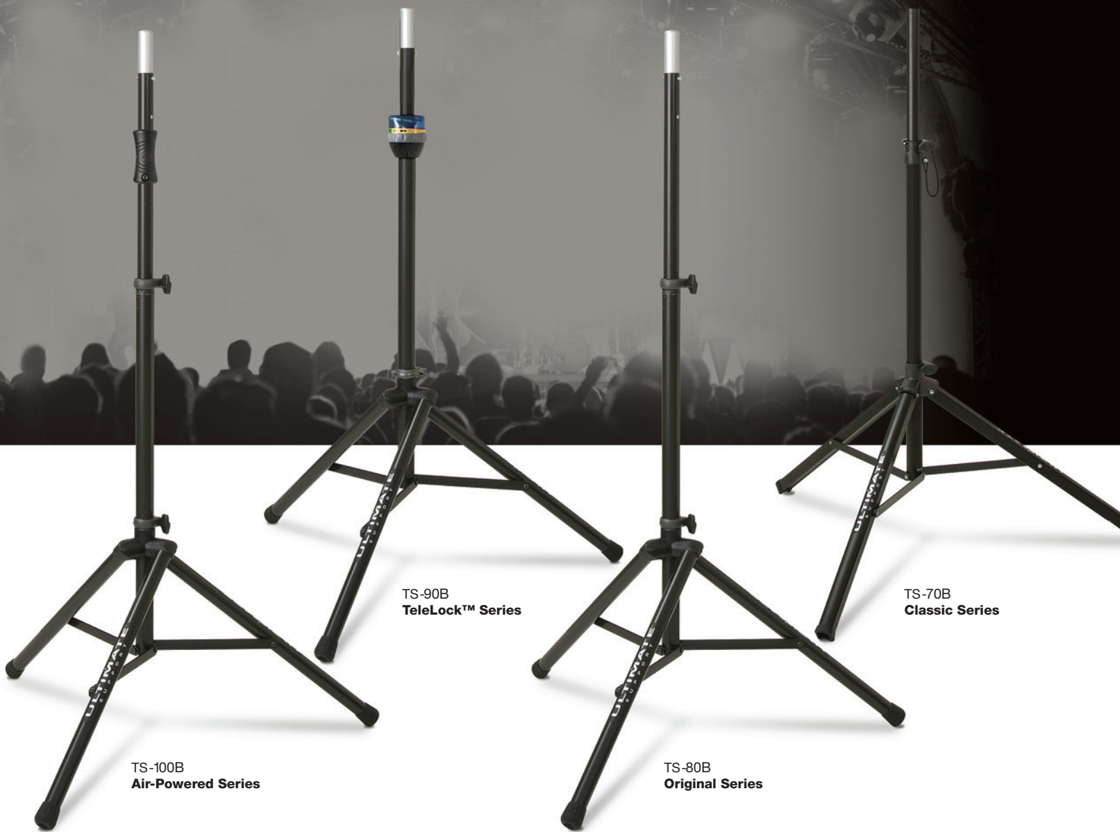
TS-100B Air-Powered Series