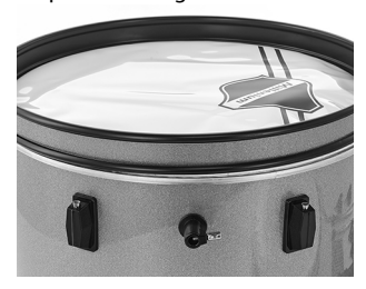
Step 2: Mounting the bass drum