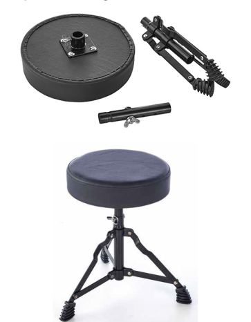
The max. load capacity of the stool