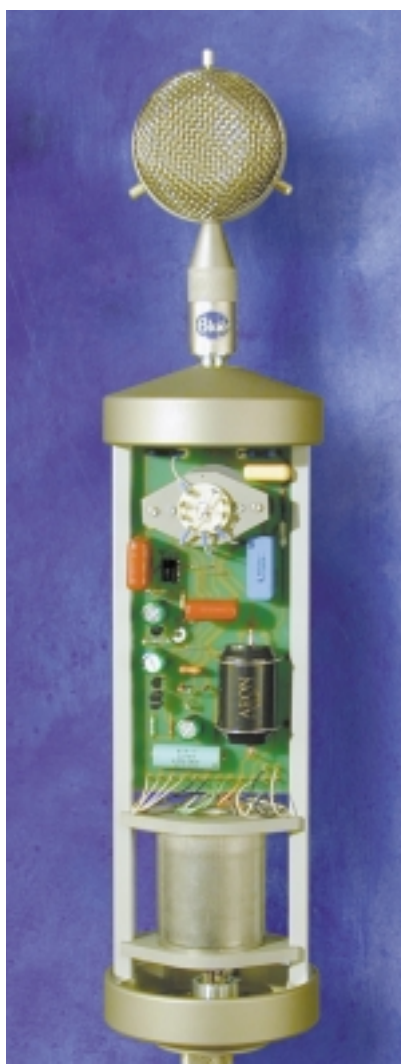
Inside the Bottle

utmost protection. The Bottle is finished in a luxurious blue lacquer paint with other colors available by special order. Additional capsules are available from your pro audio dealer, and you’ll find a complete list of capsules detailed herein. In order to familiarize yourself with the Bottle’s specialized and unique features, please take the time to read this manual, and be sure to try the suggested recording tips.