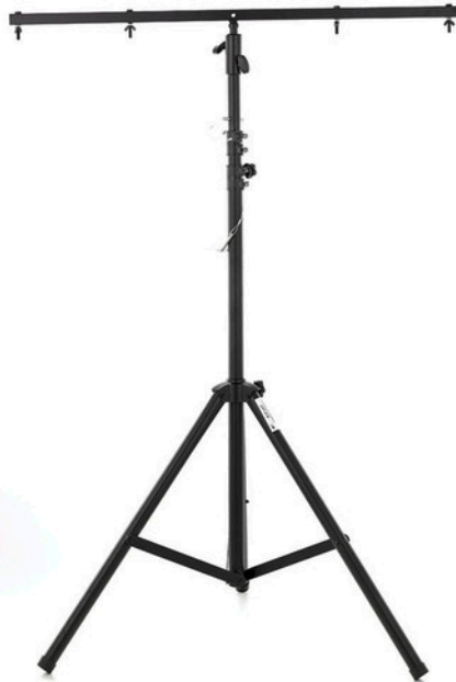
4 LST-310 Lighting Stand