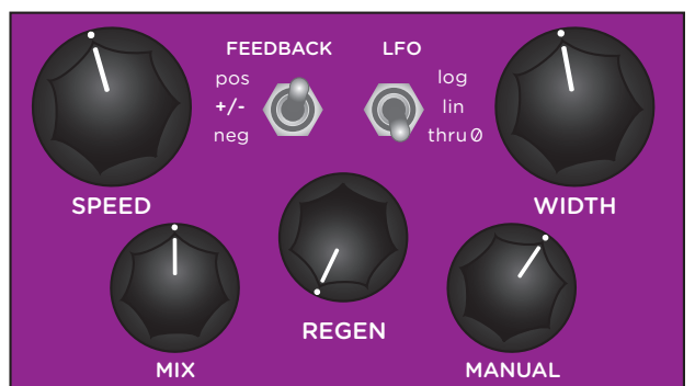
Keep Yourself Alive