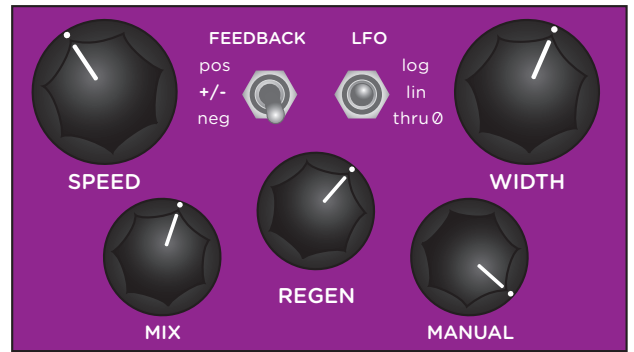
70's Vintage Flanger