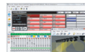
DASLIGHT DVC 1