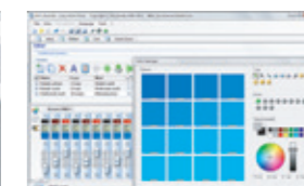
EASY STAND ALONE 1