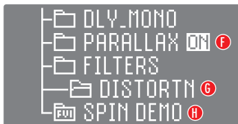
fig. 3: BANK LIBRARY SCREEN