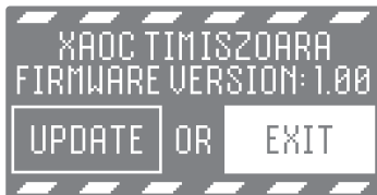
fig. 4: SERVICE MENU SCREEN