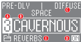
fig. 2: MAIN SCREEN

During normal operation, turning the encoder selects the effect PROGRAM from the currently loaded BANK of up to eight PROGRAMS (fig. 2). The PROGRAM is only loaded when the selection is confirmed by pressing the encoder. Pressing and holding the encoder knob for one second displays the content of the memory card as a folder list, with each folder corresponding to a single BANK (fig. 3). There is a CANCEL option at the end of the list for returning to the last loaded BANK.