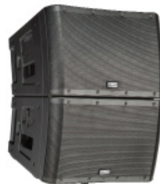
2 KLA12 on pole over KLA181

For more information, please visit qscouseofk.com/rental