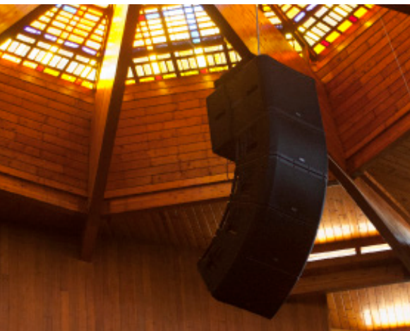
KLA Series Line Array – Also available in white

contained, SOLO completely revolutionizes the way fixed arcuate line arrays are deployed. With this unique system, installers can quickly assemble (and disassemble) a line array in a fraction of the time of comparable systems - without the need for special tools or external hardware. In less than ten seconds, installers can quickly and effortlessly secure two KLA boxes together, significantly lowering labor costs. Light weight, self-powered and easy to deploy, KLA may very well represent a client’s first real opportunity to fully embrace line array technology.