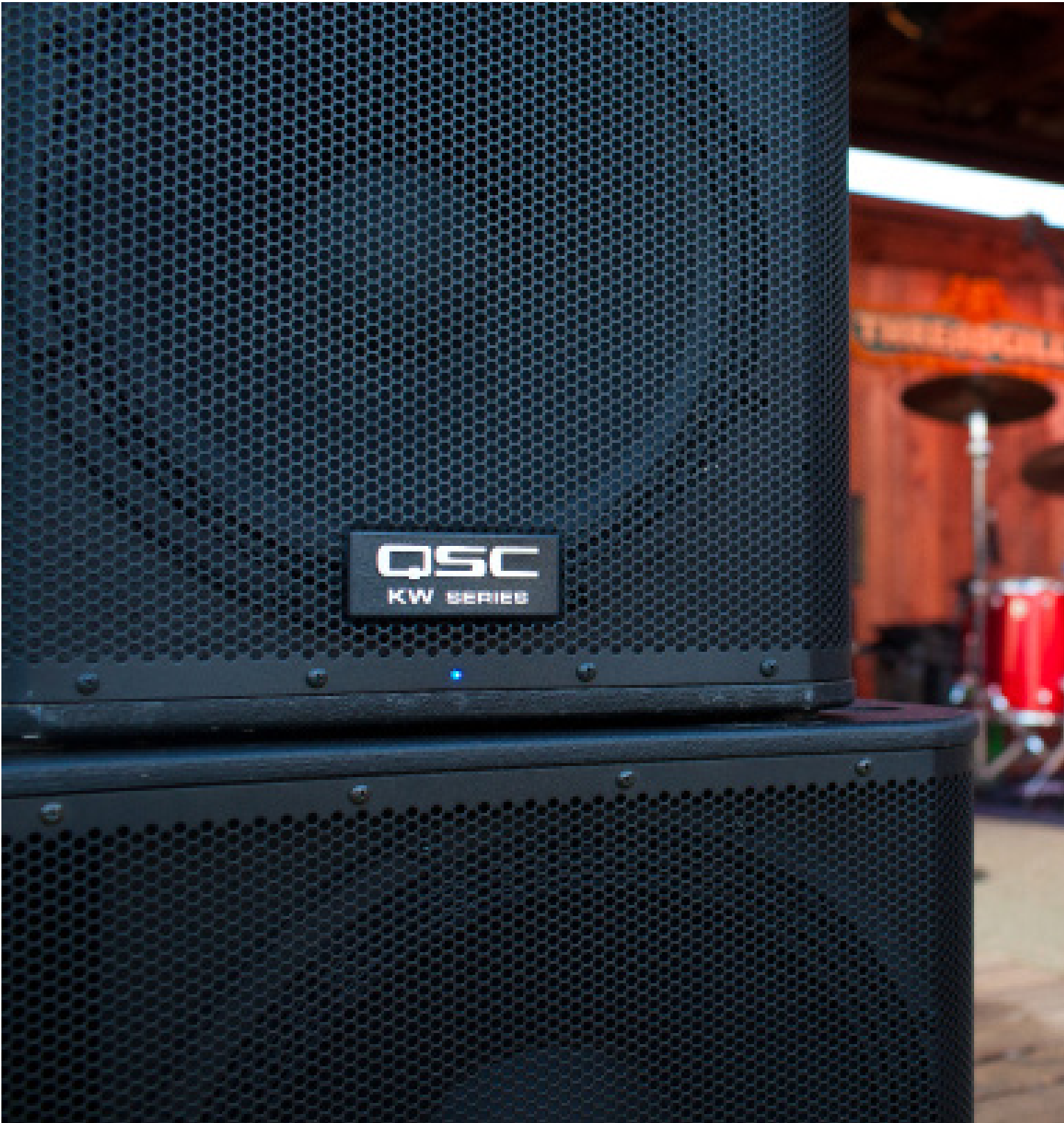
KW153 stacked on KW181