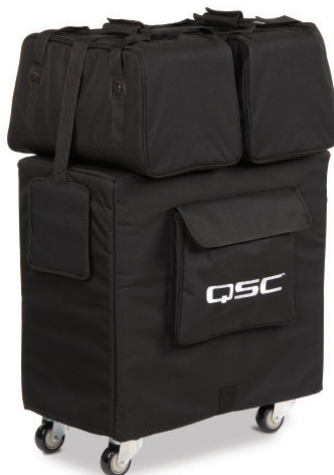
A pair of K8s with totes strapped to a KSub with cover

In addition to providing front-of-house duty, three K Family models (K10, K12, KW122) can be utilized horizontally, as a floor wedge, providing high-output, quality stage monitoring without any compromise in performance.