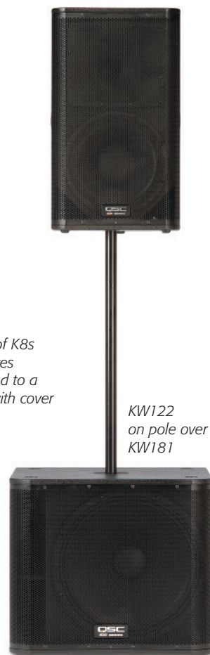
KW122 on pole over KW181