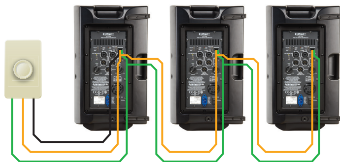
Remote Level Control

For more information, please visit qscouseofk.com/installed