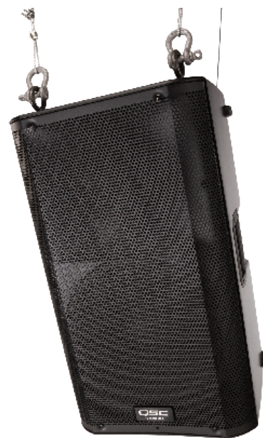
K Series with M10 Kit

The Remote Level Control featured on all K Family products offers the venue a clean and easy way to control