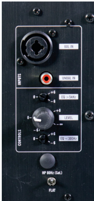
The rear panel houses input sockets for both balanced and unbalanced signals, as well as trim pots for high and low shelving EQs, and an overall level control.

If you have always aspired to Adam monitors but found them beyond your budget, you may well find the F5s are just what you need, with the option of going for the F7s if you need something for a slightly larger room. It could