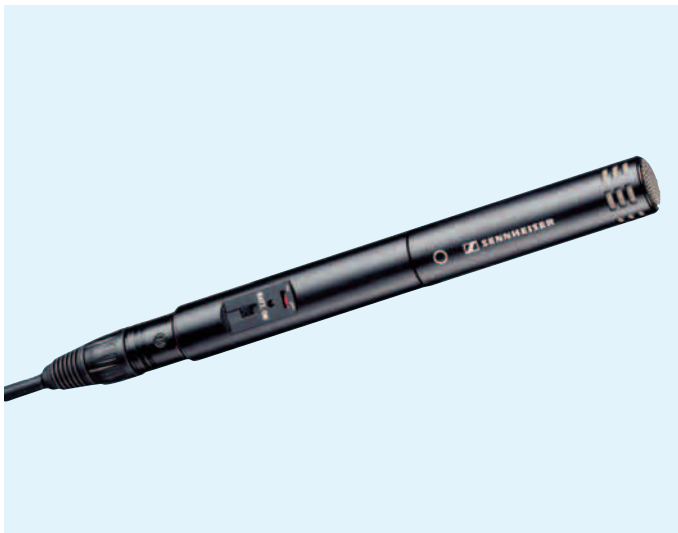
Pictured with K6 powering module and cable (available separately)

The ME 62 is an omni-directional microphone head suitable for K6 and K6P powering modules. It can be used for reporting, discussions and interviews. The ME 62 is particularly suitable for good reproduction of 'room' ambience and 'spaced omni' stereo recording. Matt black, anodised, scratch-resistant finish.