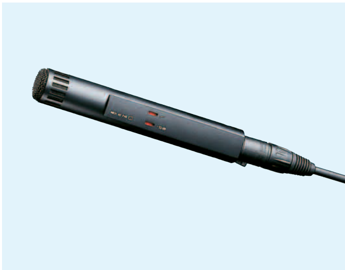
Cable pictured is an accessory not supplied with the microphone

The cardioid MKH 40 has a large number of applications, for example as a main microphone, especially in lightly reverberant or acoustically less perfect rooms, with instrumental groups or for speech applications. Its wide-angled, neutral directional characteristics and high level of reverse attenuation ensure an exceptionally balanced sound.