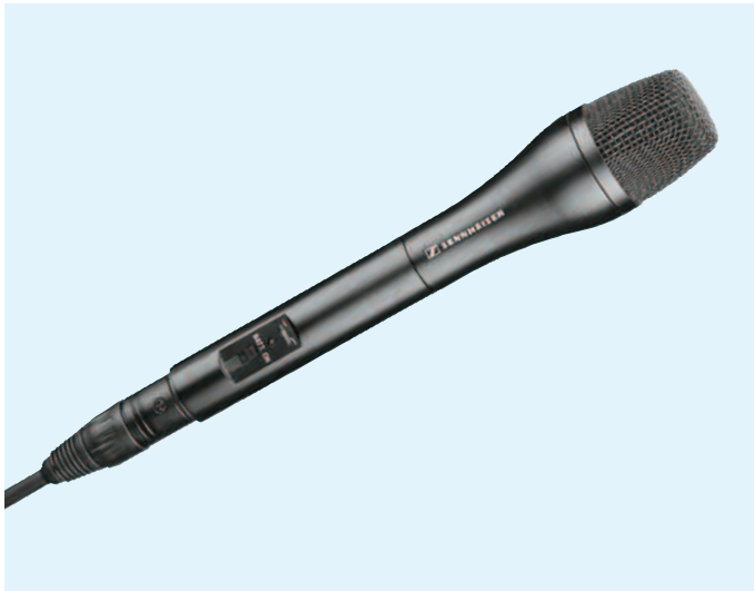
Pictured with K6 powering module and cable (available separately)

The ME 65 is a super-cardioid microphone head designed for use with the K6 and K6P powering modules. It is especially suited to vocal and speech applications. Matt black, anodised, scratch-resistant finish.