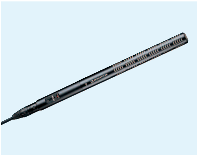
Pictured with K6 powering module and cable (available separately)

The ME 66 is a short gun microphone head designed for use with the K6 and K6P powering modules. It is especially suitable for reporting, film and broadcast location applications and for picking up quiet signals in noisy or acoustically live environments as it discriminates against sound not emanating from the main pick-up direction. Matt black, anodised, scratch-resistant finish.