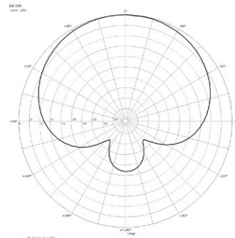
Polar pattern @ 1 kHz