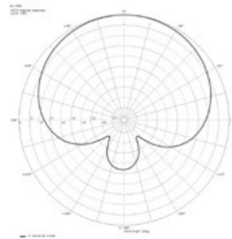
Polar pattern @ 1 kHz