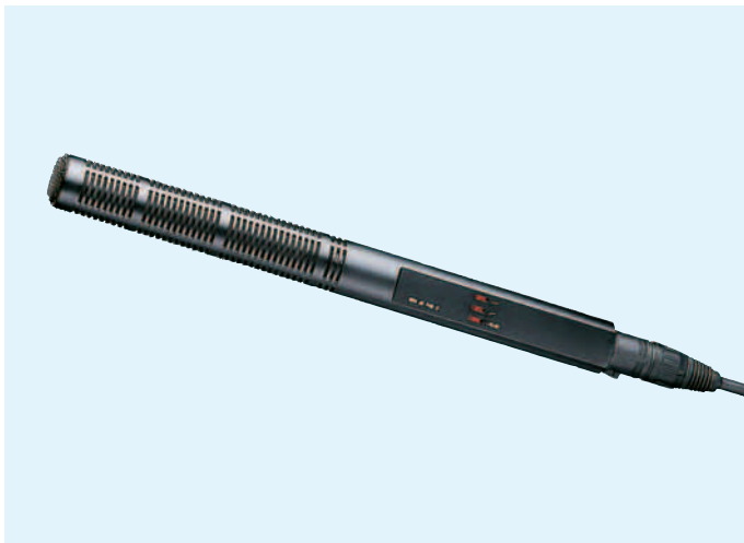
Cable pictured is an accessory not supplied with the microphone

The MKH 60 is a lightweight short gun microphone. It is versatile and easy to handle and its superb lateral sound muting makes it an excellent choice for film and reporting applications. Its high degree of directivity ensures high sound quality for distance applications.