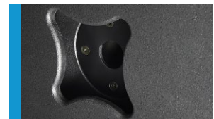
The 35 mm threaded stand socket is integrated in the carrying handle.