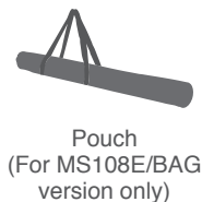
Pouch (For MS108E/BAG version only)