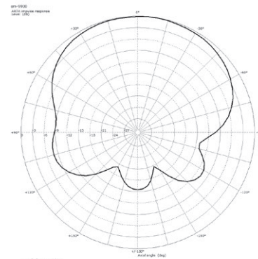
Polar pattern @ 1 kHz