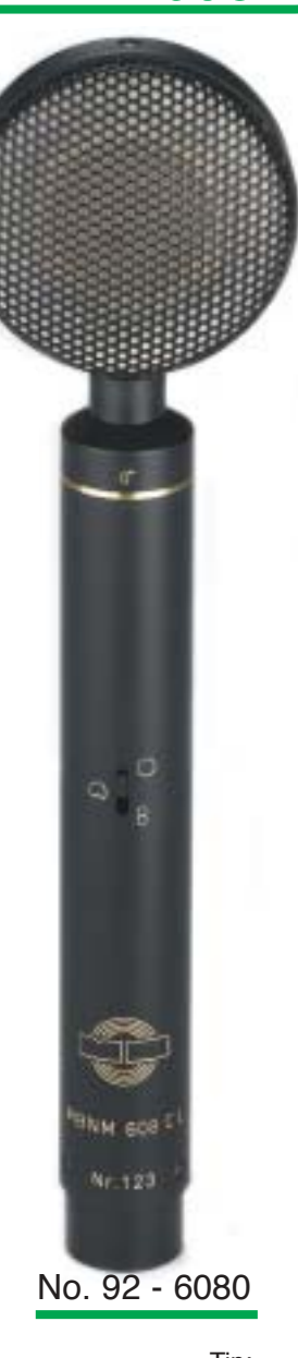
IIp: - Announcements - Face to face vocals - General instrument applications